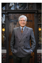
Robert P. George